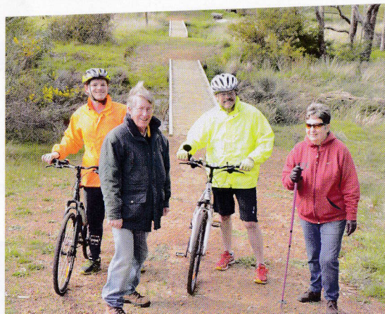
September 2016. Designed and printed by Ivory Print, Hamilton 03 5572 1121