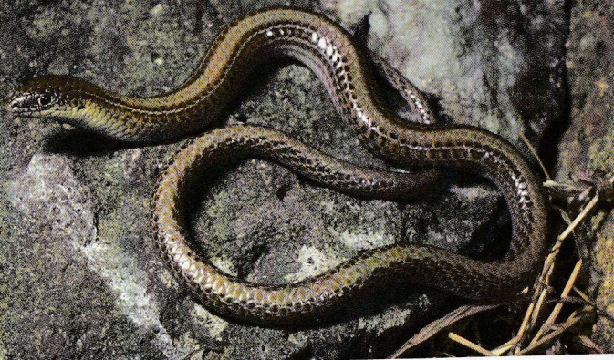
Striped Legless Lizard.